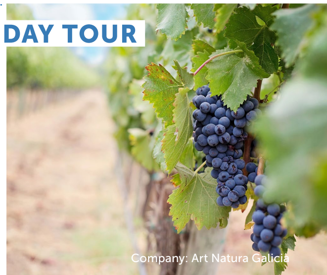
Company: Art Natura Galicia

Find more information via: www.dairyfarmer.net/activities/annual-edf-conference.html