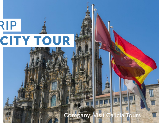
Company: Visit Galicia Tours

PRICE: 5€ / PERSON Find more information via: www.dairyfarmer.net/activities/annual-edf-conference.html